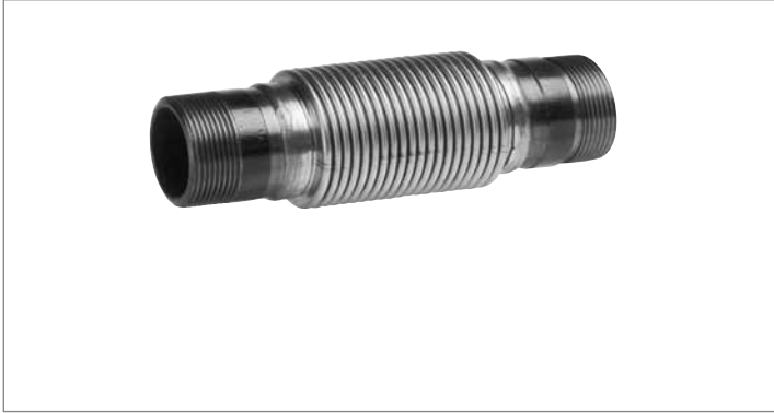
DN 15 - DN 25